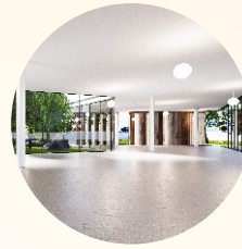
Mega Multipurpose Hall