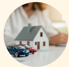
Extra Car Parking Space in front of every plot