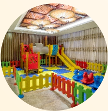
Children Playing Area