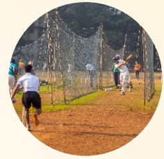
Cricket Practice Pitch